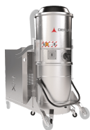
TX Contentitore camera e struttura in acciaio INOX AISI 304