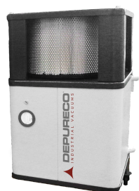
POST H Post-Cartuccia