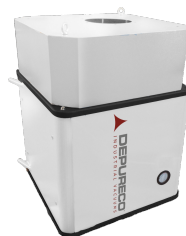
PRE H Pre-Cartuccia