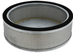
HEPA 14 Absolute filter (EN 1822) 22.000 cm 2 filter surface H14 Class Filter (EN 1822) Glass fiber