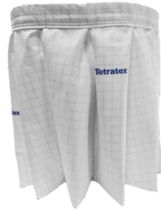
PTFE ANT Antistatic PTFE filter (M class EN 60335-2-69)