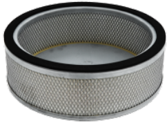
HEPA 14 Absolute filter (EN 1822) 22.000 cm 2 filter surface H14 Class Filter (EN 1822) Glass fiber