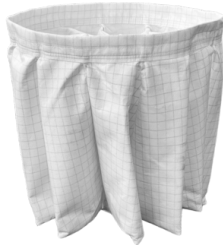
ANT M Antistatic filter (M class EN 60335-2-69)