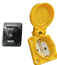
RC SCHUKO Remote control by power tool (MAX 2000 W)