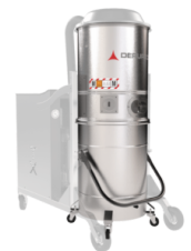
GX Stainless steel bin and chamber AISI 304