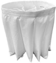
PTFE PTFE Filter (M class EN 60335-2-69)