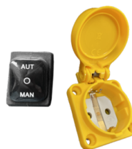
RC SCHUKO Remote control by power tool (MAX 2000 W)