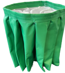
MTF Teflon filter (M class EN 60335-2-69)