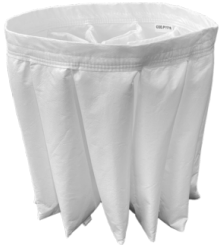
PTFE PTFE Filter (M class EN 60335-2-69)