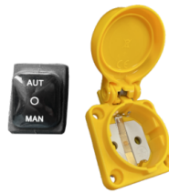
RC SCHUKO Remote control by power tool (MAX 2000 W)