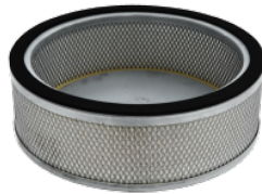
HEPA 14 Absolute filter (EN 1822) 22.000 cm 2 filter surface H14 Class Filter (EN 1822) Glass fiber