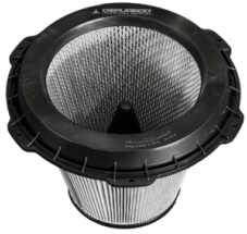
HEPA 13 Absolute filter (EN 1822) 35.000 cm 2 filter surface H13 Class Filter (EN 1822) Glass fiber