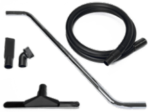
P13639 WET & DRY KIT Ø 40MM Versatile kit designed to easily switch between vacuuming dust and liquid debris. - 3-meter Evaflex hose - 1x 50/40 antistatic rubber ho ...