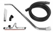
P12348 DRY KIT Ø 50MM Kit for cleaning large areas of dry dust that require high suction power. - 3-meter Evaflex hose - 2x antistatic rubber sleeves - Flat ...