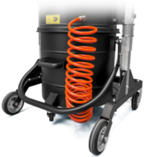
KDP Differential pressure KIT for bag