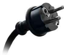
SHUKO TYPE PLUG