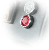
FILTER CLOGGING INDICATOR Filter clogged or need to be replaced indicator light