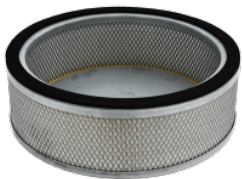
HEPA 14 Absolute filter (EN 1822) 22.000 cm 2 filter surface H14 Class Filter (EN 1822) Glass fiber