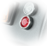
FILTER CLOGGING INDICATOR Filter clogged or need to be replaced indicator light