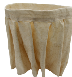
NOMEX 250° Celsius resistant filter