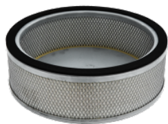
HEPA 14 Absolute filter (EN 1822) 22.000 cm 2 filter surface H14 Class Filter (EN 1822) Glass fiber