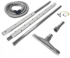
P11857 OVEN CLEANING KIT Ø 40MM