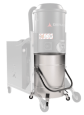
BX Stainless steel bin AISI 304