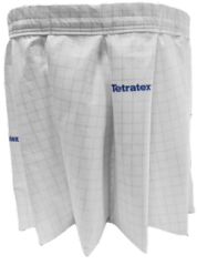
PTFE ANT Antistatic PTFE filter (M class EN 60335-2-69)