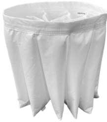
PTFE PTFE Filter (M class EN 60335-2-69)