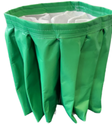
MTF Teflon filter (M class EN 60335-2-69)