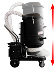
TELESCOPIC CHASSIS To reduce the footprint and facilitate transportation