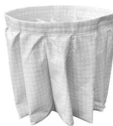
ANT M Antistatic filter (M class EN 60335-2-69)