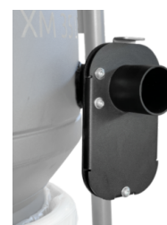
SD Sliding damper