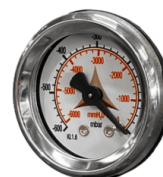
VACUUM GAUGE Vacuum gauge for indication of filter clogged or in need of replacement