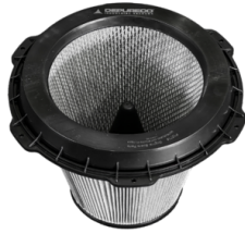
HEPA 13 Absolute filter (EN 1822) 35.000 cm 2 filter surface H13 Class Filter (EN 1822) Glass fiber