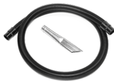
P12350 STARTER KIT Ø 50MM A compact, essential solution for quick vacuuming on simple surfaces. - 3-meter Evaflex hose - 2 antistatic rubber sleeves - Flat nozzle