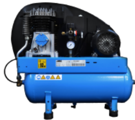
COM Compressor on board