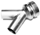
P11717 "Y" REDUCER BRANCH Ø 70/50/50MM Galvanised steel "Y" reducer 70/50/50 mm