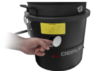
JC Jet Clean