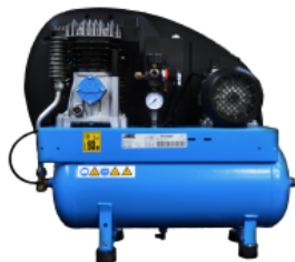
COM Compressor on board