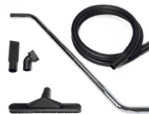
P13640 DRY KIT Ø 40MM Optimized configuration for thorough cleaning of floors and surfaces from dry dust. - 3-meter Evaflex hose - 1x50/40 antistatic rubber ...