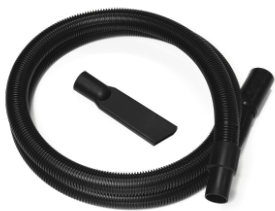
P13638 STARTER KIT Ø 40MM Basic kit containing specific accessories for 40 mm diameter solids and liquids vacuuming