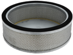
HEPA 14 Absolute filter (EN 1822) 28.000 cm 2 filter surface H14 Class Filter (EN 1822) Glass fiber