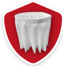
3 YEARS WARRANTY Purchasing the replacement filter along with the vacuum