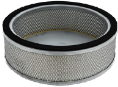
HEPA 14 Absolute filter (EN 1822) 28.000 cm 2 filter surface H14 Class Filter (EN 1822) Glass fiber