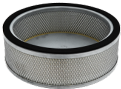
HEPA 14 Absolute filter (EN 1822) 22.000 cm 2 filter surface H14 Class Filter (EN 1822) Glass fiber