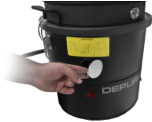
JC Jet Clean