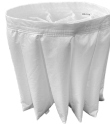
PTFE PTFE Filter (M class EN 60335-2-69)