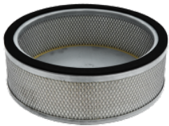
HEPA 14 Absolute filter (EN 1822) 22.000 cm 2 filter surface H14 Class Filter (EN 1822) Glass fiber