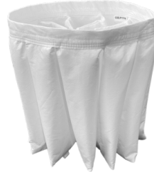
PTFE PTFE Filter (M class EN 60335-2-69)