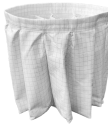
ANT M Antistatic filter (M class EN 60335-2-69)