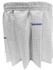
PTFE ANT Antistatic PTFE filter (M class EN 60335-2-69)