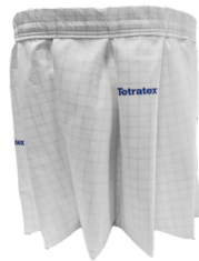
PTFE ANT Antistatic PTFE filter (M class EN 60335-2-69)