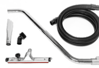
P12348 DRY KIT Ø 50MM Kit for cleaning large areas of dry dust that require high suction power. - 3-meter Evaflex hose - 2x antistatic rubber sleeves - Flat ...