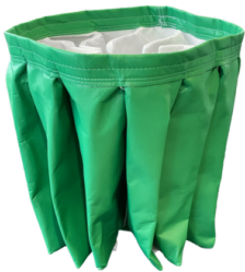
MTF Teflon filter (M class EN 60335-2-69)