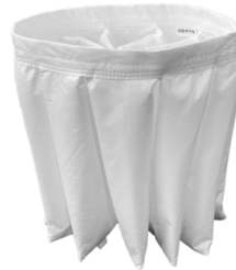
PTFE PTFE Filter (M class EN 60335-2-69)