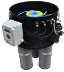
SP Automatic reverse jet cleaning system Antistatic M class filter (EN 60335-2-69), 3 Polyester filter cartridges, 9 m 2 filter surface