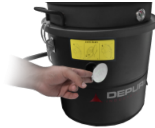
JC Jet Clean