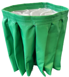
MTF Teflon filter (M class EN 60335-2-69)