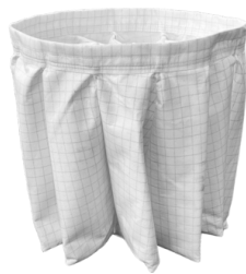
ANT M Antistatic filter (M class EN 60335-2-69)