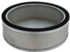
HEPA 14 Absolute filter (EN 1822) 28.000 cm 2 filter surface H14 Class Filter (EN 1822) Glass fiber