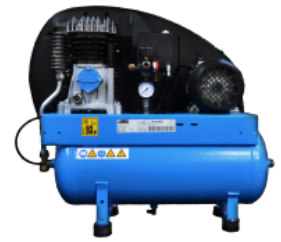
COM Compressor on board Compressor fitted on the back cover