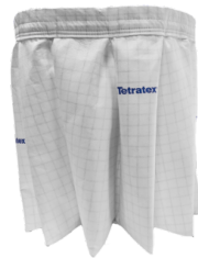
PTFE ANT Antistatic PTFE filter (M class EN 60335-2-69)