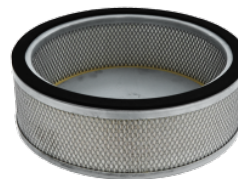
HEPA 14 Absolute filter (EN 1822) 22.000 cm 2 filter surface H14 Class Filter (EN 1822) Glass fiber