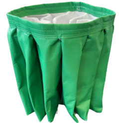
MTF Teflon filter (M class EN 60335-2-69)