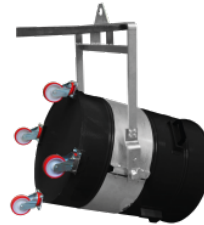
P01033 TILTING KIT FOR DUST BIN – BRACKET Ø 450MM Lifting bracket with forklift for 450 mm diameter container fitted with lifting ring. This way the vacuum's container can be lifted and tilt ...