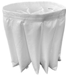
PTFE PTFE Filter (M class EN 60335-2-69)