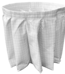
ANT M Antistatic filter (M class EN 60335-2-69)