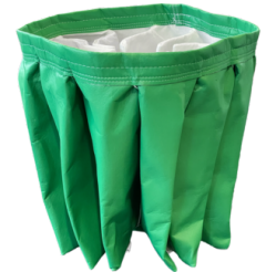
MTF Teflon filter (M class EN 60335-2-69)