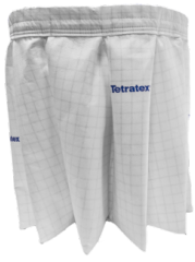
PTFE ANT Antistatic PTFE filter (M class EN 60335-2-69)