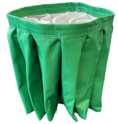
MTF Teflon filter (M class EN 60335-2-69)