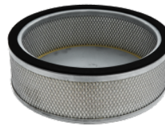
HEPA 14 Absolute filter (EN 1822) 22.000 cm 2 filter surface H14 Class Filter (EN 1822) Glass fiber