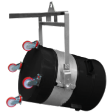
P11287 TILTING KIT FOR DUST AGAIN – COMPLETE RING Ø 450MM Support ring for lifting a 450 mm diameter container. Essential if used with the lifting bracket. Thanks to these two devices, the container ...