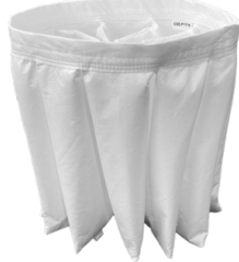
PTFE PTFE Filter (M class EN 60335-2-69)