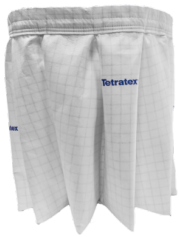
PTFE ANT Antistatic PTFE filter (M class EN 60335-2-69)