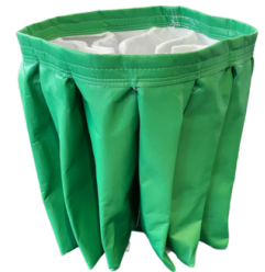
MTF Teflon filter (M class EN 60335-2-69)