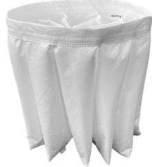
PTFE PTFE Filter (M class EN 60335-2-69)