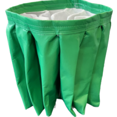
MTF Teflon filter (M class EN 60335-2-69)