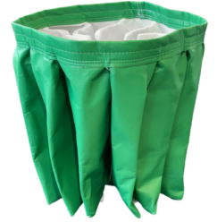
MTF Teflon filter (M class EN 60335-2-69)