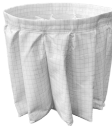
ANT M Antistatic filter (M class EN 60335-2-69)