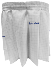
PTFE ANT Antistatic PTFE filter (M class EN 60335-2-69)