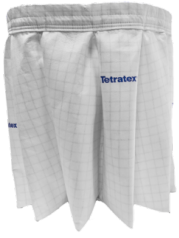
PTFE ANT Antistatic PTFE filter (M class EN 60335-2-69)