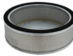
HEPA 14 Absolute filter (EN 1822) 22.000 cm 2 filter surface H14 Class Filter (EN 1822) Glass fiber