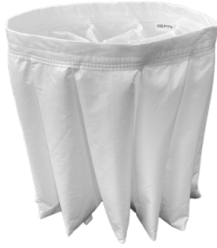
PTFE PTFE Filter (M class EN 60335-2-69)