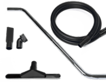
P13639 WET & DRY KIT Ø 40MM Versatile kit designed to easily switch between vacuuming dust and liquid debris. - 3-meter Evaflex hose - 1x 50/40 antistatic rubber ho ...