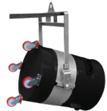
P11287 TILTING KIT FOR DUST AGAIN – COMPLETE RING Ø 450MM Support ring for lifting a 450 mm diameter container. Essential if used with the lifting bracket. Thanks to these two devices, the container ...