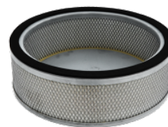
HEPA 14 Absolute filter (EN 1822) 22.000 cm 2 filter surface H14 Class Filter (EN 1822) Glass fiber