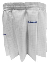
PTFE ANT Antistatic PTFE filter (M class EN 60335-2-69)