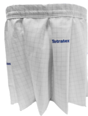
PTFE ANT Antistatic PTFE filter (M class EN 60335-2-69)