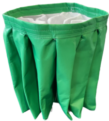
MTF Teflon filter (M class EN 60335-2-69)