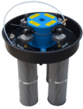
SP Automatic reverse jet cleaning system Antistatic M class filter (EN 60335-2-69), 4 Polyester filter cartridges, 12 m 2 filter surface