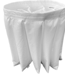
PTFE PTFE Filter (M class EN 60335-2-69)