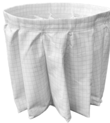
ANT M Antistatic filter (M class EN 60335-2-69)