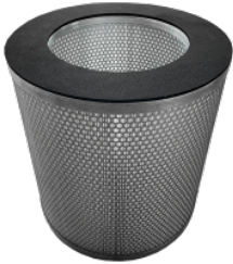
HEPA 14 Absolute filter (EN 1822) 110.000 cm 2 filter surface H14 Class Filter (EN 1822) Glass fiber