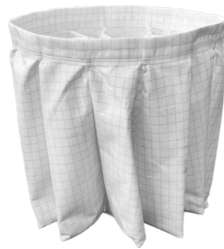
ANT M Antistatic filter (M class EN 60335-2-69)