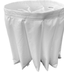
PTFE PTFE Filter (M class EN 60335-2-69)