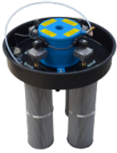
SP Automatic reverse jet cleaning system Antistatic M class filter (EN 60335-2-69), 4 Polyester filter cartridges, 18 m 2 filter surface