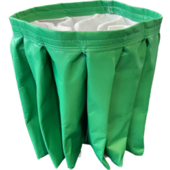
MTF Teflon filter (M class EN 60335-2-69)