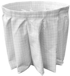
ANT M Antistatic filter (M class EN 60335-2-69)