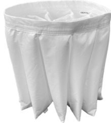
PTFE PTFE Filter (M class EN 60335-2-69)