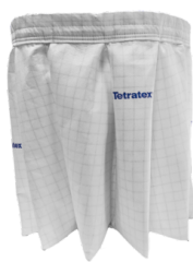
PTFE ANT Antistatic PTFE filter (M class EN 60335-2-69)