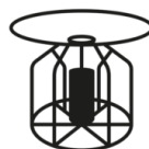
FLT Floater device