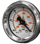
VACUUM GAUGE Vacuum gauge for indication of filter clogged or in need of replacement