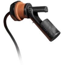
ELECTRIC FLOATING DEVICE System that automatically stops suction when the maximum level is reached