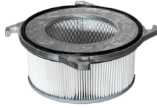
OIL-PROOF CARTRIDGE Oil-proof cartridge for motor protection