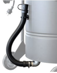
LIQUID DISCHARGE HOSE