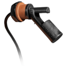
ELECTRIC FLOATING DEVICE System that automatically stops suction when the maximum level is reached