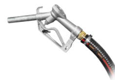
HOSE WITH DISCHARGE VALVE