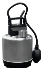
PUMP Continuous discharge pump