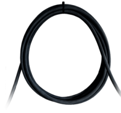
POWER SUPPLY CABLE

Vacuum gauge for indication of filter clogged or in need of replacement