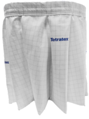
PTFE ANT Antistatic PTFE filter (M class EN 60335-2-69)