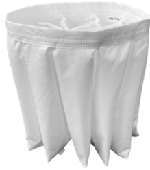
PTFE PTFE Filter (M class EN 60335-2-69)