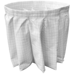
ANT M Antistatic filter (M class EN 60335-2-69)