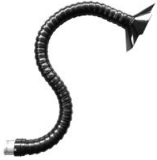
P13970 ARTICULATED SUCTION ARM D70 Flexible PVC suction arm, retrofittable on existing models - 1.2 mt length - d70