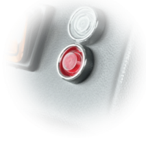
FILTER CLOGGING INDICATOR Filter clogged or need to be replaced indicator light