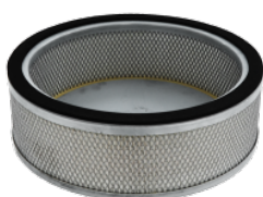
HEPA 14 Absolute filter (EN 1822) 22.000 cm 2 filter surface H14 Class Filter (EN 1822) Glass fiber