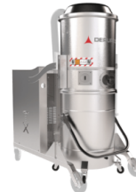
TX Stainless steel bin, chamber and frame AISI 304