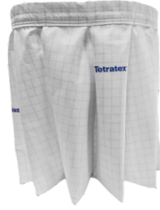
PTFE ANT Antistatic PTFE filter (M class EN 60335-2-69)