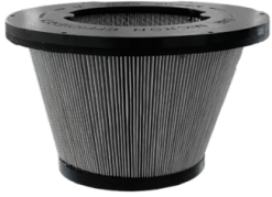
HEPA 13 Absolute filter (EN 1822) 35.000 cm 2 filter surface H13 Class Filter (EN 1822) Glass fiber