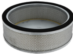
HEPA 14 Absolute filter (EN 1822) 22.000 cm 2 filter surface H14 Class Filter (EN 1822) Glass fiber