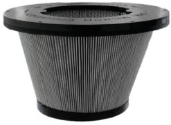
HEPA 13 Absolute filter (EN 1822) 35.000 cm 2 filter surface H13 Class Filter (EN 1822) Glass fiber