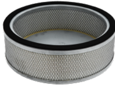
HEPA 14 Absolute filter (EN 1822) 22.000 cm 2 filter surface H14 Class Filter (EN 1822) Glass fiber