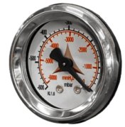
VACUUM GAUGE Vacuum gauge for indication of filter clogged or in need of replacement