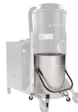
BX Stainless steel bin AISI 304