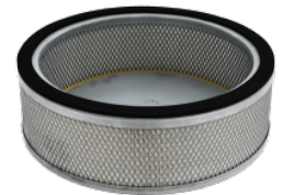
HEPA 14 Absolute filter (EN 1822)