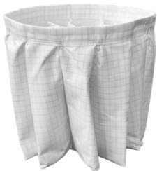
ANT M Antistatic filter (M class EN 60335-2-69)