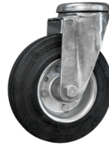
WHEELS Non-marking pivoting wheels