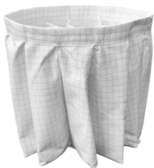
ANT M Antistatic filter (M class EN 60335-2-69)