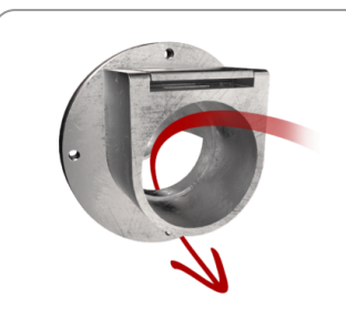
DEFLECTOR Internal deflector to protect the filter