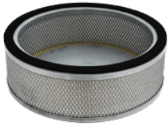
HEPA 14 Absolute filter (EN 1822) 28.000 cm 2 filter surface H14 Class Filter (EN 1822) Glass fiber