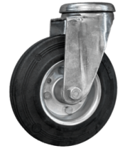
WHEELS Non-marking pivoting wheels