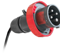
4-PIN ATEX INDUSTRIAL PLUG