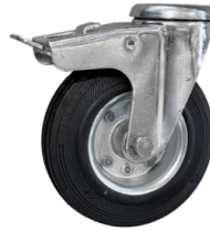
WHEEL WITH BRAKE Non-marking wheel with integrated brake