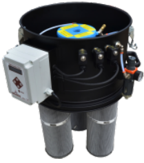
SP Automatic reverse jet cleaning system Antistatic M class filter (EN 60335-2-69), 3 Polyester filter cartridges, 9 m 2 filter surface