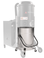
BX Stainless steel bin AISI 304