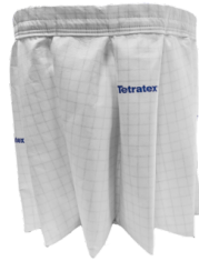
PTFE ANT Antistatic PTFE filter (M class EN 60335-2-69)