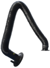
P12336 SUCTION ARM Ø 160MM/L 3M 160mm diameter suction arm jointed in three parts for a total length of 3 metres, equipped with an articulated hood and valve for adjusting ...