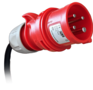
PLUG 4-pole industrial plug