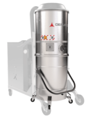
GX Stainless steel bin and chamber AISI 304