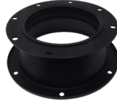
P12334 FLANGED REDUCTION FOR ARM Ø 160MM Coupling flange on DF industrial vacuum for 160 mm diameter flanged arm