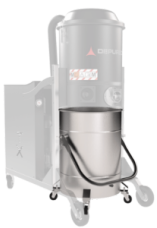
BX Stainless steel bin AISI 304