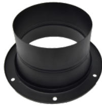
P12300/200 FLANGED REDUCTION FOR HOSE Ø 200MM Coupling flange on DF industrial vacuum for 200 mm diameter flexible hose