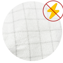
ANTISTATIC FILTRATION Antistatic filtration to discharge static energy