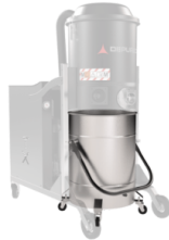
BX Stainless steel bin AISI 304