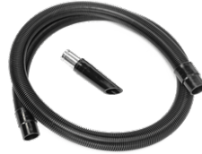
P12378 ANTISTATIC STARTER KIT Ø 50MM Basic kit containing antistatic accessories for application with 50 mm diameter ATEX vacuum cleaner