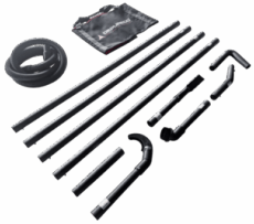
P14901/EX VERTIDEX – ATEX-CERTIFIED ACCESSORY KIT FOR CLEANING AT HEIGHT Ø 40MM