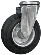
WHEELS Non-marking pivoting wheels