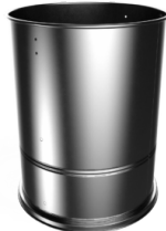
STEEL CONSTRUCTION Rugged industrial coated steel construction