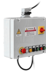
ELECTRICAL PANEL Electrical panel, implementable with additional functions