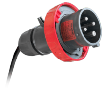
4-PIN ATEX INDUSTRIAL PLUG