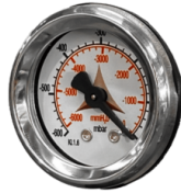
VACUUM GAUGE Vacuum gauge for indication of filter clogged or in need of replacement