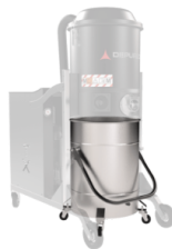
BX Stainless steel bin AISI 304