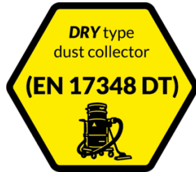
DRY TYPE VACUUM CLEANER Atex-certified vacuum cleaner with dry dust filtration, as per EN17348