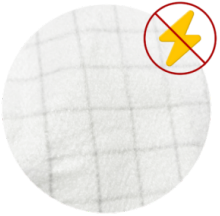
ANTISTATIC FILTRATION Antistatic filtration to discharge static energy