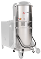
GX Stainless steel bin and chamber AISI 304