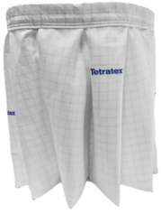
PTFE ANT Antistatic PTFE filter (M class EN 60335-2-69)