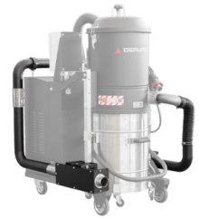
SPARK TRAP Built to capture sparks produced during welding, sanding, or polishing operations on metal parts