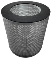
HEPA 14 Absolute filter (EN 1822) 110.000 cm 2 filter surface H14 Class Filter (EN 1822) Glass fiber