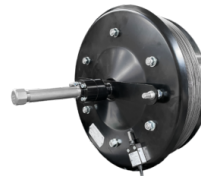
FLAMELESS VENT A valve that contains the flame and the overpressure generated by a possible explosion.