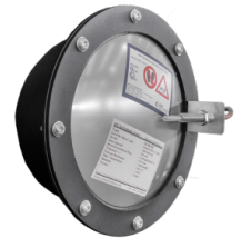
PANEL VENT FOR DIRECTIONAL EXPLOSION An explosion vent designed to break at a specific pressure and release the explosive pressure in a safe area. Panel vent for explosion