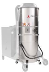
GX Stainless steel bin and chamber AISI 304