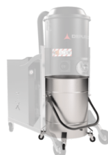
BX Stainless steel bin AISI 304