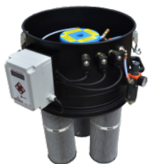
SP Automatic reverse jet cleaning system