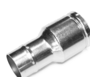
P10866 IRON REDUCER Ø 70/50MM Reducer for vacuum quick fitting in galvanised steel 70/50 mm diameter