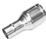
P10867 IRON REDUCER Ø 70/40MM Reducer for vacuum quick fitting in galvanised steel 70/40 mm diameter