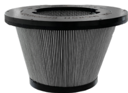
HEPA 13 Absolute filter (EN 1822) 35.000 cm 2 filter surface H13 Class Filter (EN 1822) Glass fiber