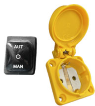
RC SCHUKO Remote control by power tool (MAX 2000 W)