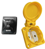
RC SCHUKO Remote control by power tool (MAX 2000 W)