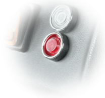
FILTER CLOGGING INDICATOR Filter clogged or need to be replaced indicator light