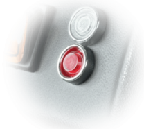
FILTER CLOGGING INDICATOR Filter clogged or need to be replaced indicator light