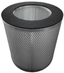
HEPA 14 Absolute filter (EN 1822) 110.000 cm 2 filter surface H14 Class Filter (EN 1822) Glass fiber