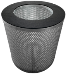
HEPA 14 Absolute filter (EN 1822) 110.000 cm 2 filter surface H14 Class Filter (EN 1822) Glass fiber