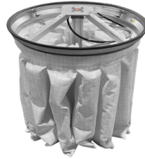
PSC Semiautomatic pneumatic filter shaker