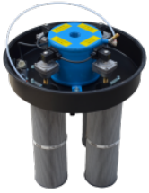
SP Automatic reverse jet cleaning system Antistatic M class filter (EN 60335-2-69), 4 Polyester filter cartridges, 12 m 2 filter surface