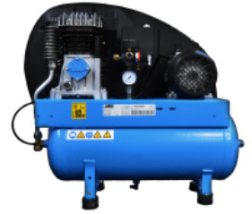
COM Compressor on board Compressor fitted on the back cover