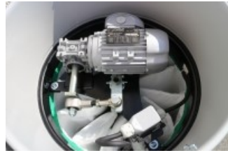
SE Semiautomatic electrical filter shaker