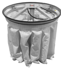
PSC Semiautomatic pneumatic filter shaker