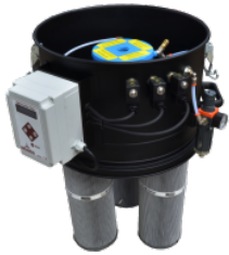
SP Automatic reverse jet cleaning system Antistatic M class filter (EN 60335-2-69), 3 Polyester filter cartridges, 9 m 2 filter surface