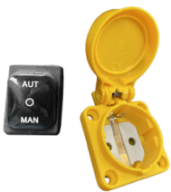
RC SCHUKO Remote control by power tool (MAX 2000 W)