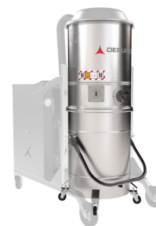
GX Stainless steel bin and chamber AISI 304